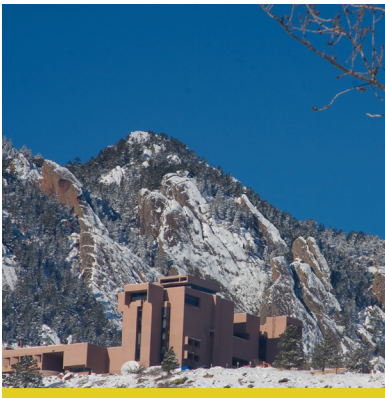
NCAR in Boulder, CO