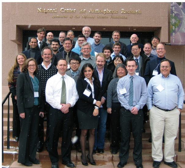
FIG. 1. Meeting participants take a break from the workshop in Boulder, Colorado, to pose in the falling snow.

Together, the participants' wide diversity of skill sets included expertise on the Fukushima Dai-ichi incident, nuclear power plant operations and safety, issues associated with measuring radiation during and following the incident, atmospheric boundary layer, transport and dispersion, source term estimation (STE) methods for hazardous airborne materials, and numerical weather prediction and data assimilation. The goal of the workshop was to present current STE approaches, available data, and discuss how the current state of the science can be extended to address these challenging unanswered questions related to the FD-NPP incident. Information from the workshop is being compiled and documented for use by the scientific community to develop and enhance technologies that could be used in the future should a similar release of radiation of unknown quantity happen again. A day and a half of technical presentations set the stage for a subsequent day of open discussions both among the workshop steering