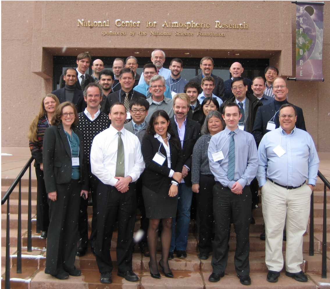
Figure 1. Meeting participants take a break from the workshop in Boulder, CO to pose in the falling snow.